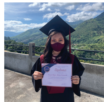
Graduates came individually to the school to receive their diplomas.

WOULD YOU GIVE A GIFT THAT MULTIPLIES TO TRANSFORM GUATEMALA?