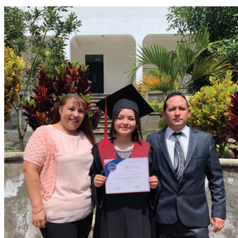
Parents were allowed to join our graduates for their special moment.

2020 has been a didn't-see-THAT-coming kind of year. Like many of you, we had to make big changes in response to the COVID-19 pandemic. Our student instruction moved online. Our graduation was performed one student at a time. Fundraising events moved online, and our sponsors gave generously to a grocery relief program that sent 75 grocery gift cards to families in need. This year was so different from what we expected, but through your generosity, we continued to see God's hand at work , transforming lives through Christ-centred education in Guatemala.